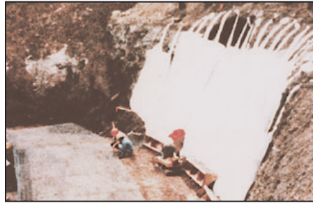
Trenches & Edge Drains

Complete customer satisfaction is obtained by emphasizing quality, customization, and endurance.