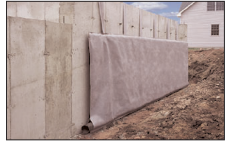
Residential & Commercial Foundations